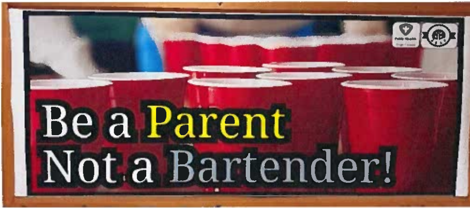
Bulletin Boards: Health & Human Services Building, Owego, NY, April 2025.