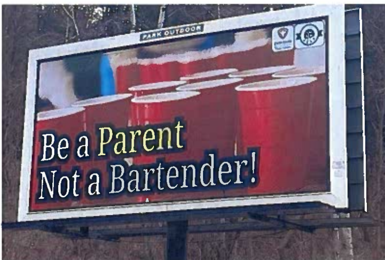
Billboard: Various Locations, April 2025