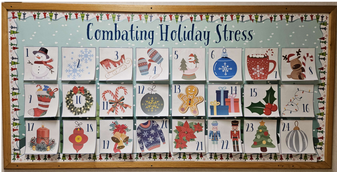
Large Bulletin Board(Outside), HHS Building, Owego, November 2023