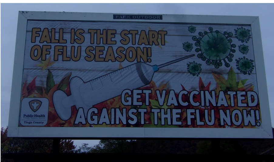
Billboards, Various Locations, November 2023