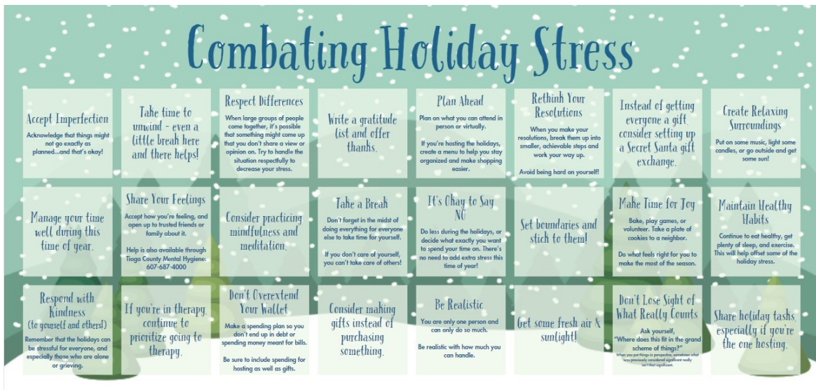
Large Bulletin Board (Inside), HHS Building, Owego, November 2023