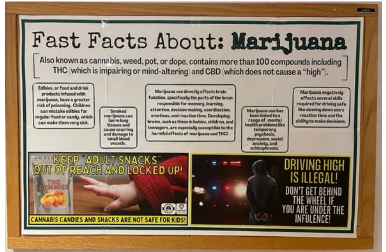
Small Bulletin Board, HHS Building, Owego, November 2023