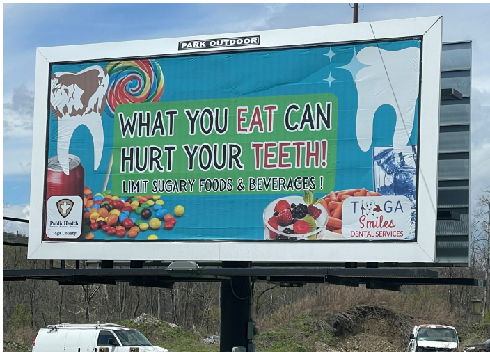
Webcam Park Outdoor 237 FE