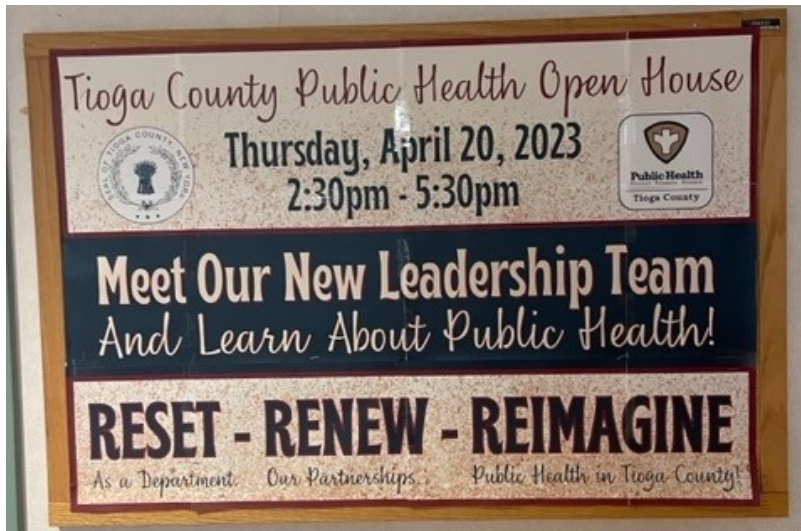
Bulletin Board, HHS Bldg, 1062 St. Route 38, Owego, April 2023