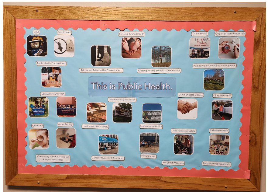
Bulletin Board, 56 Main St., Owego, April 2023