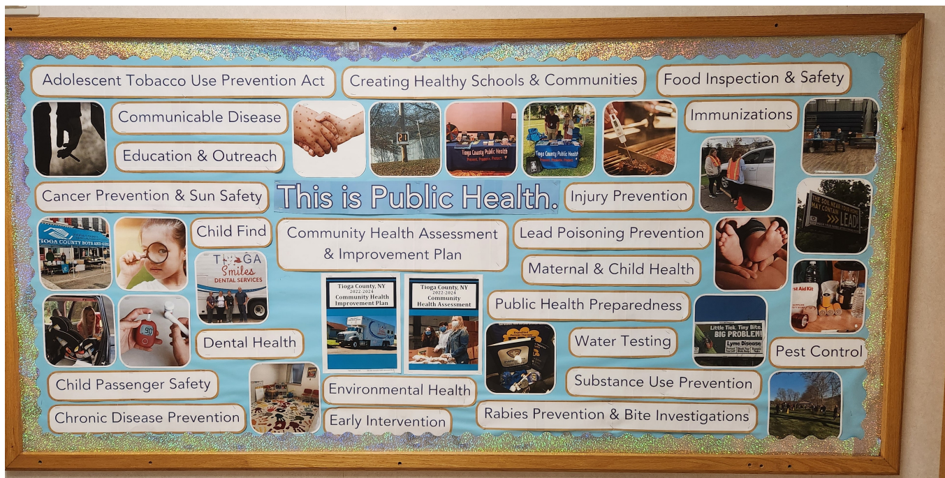
Bulletin Board, HHS Bldg, 1062 St. Route 38, Owego, April 2023