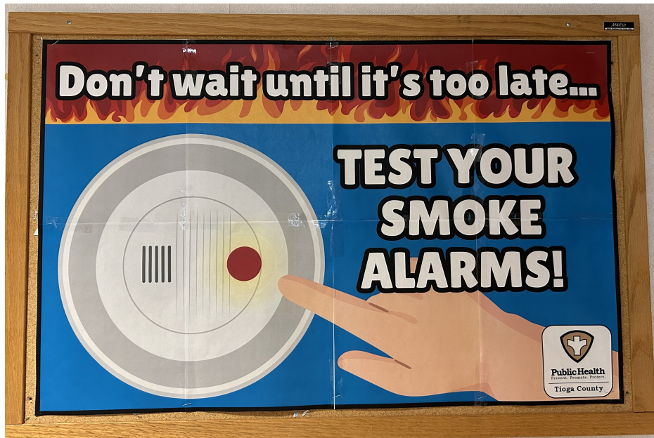
Bulletin Board: Health & Human Services Building, December 2024