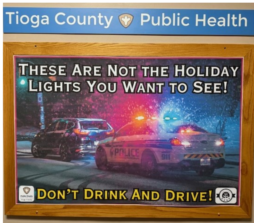
Bulletin Board: 56 Main Street, Owego, December 2024