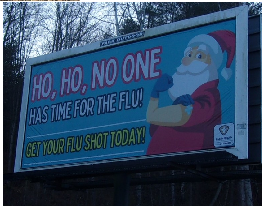
Billboard Designs, Various locations, December 2024